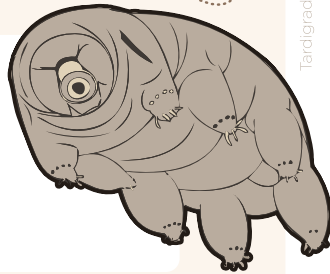
Tardigrade, the "Water Bear"